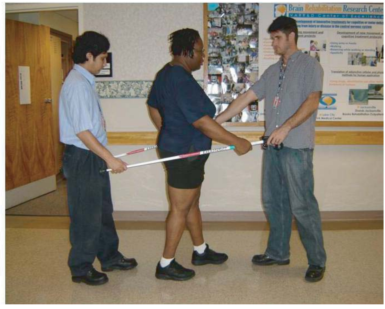
Figure 3 Locomotor Training Program (LTP) – Overground training.