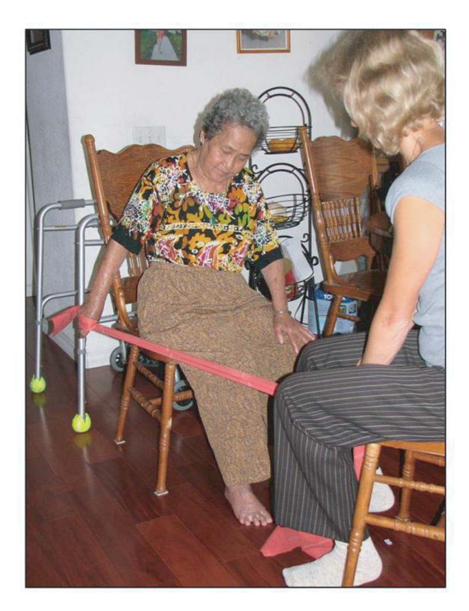
Figure 4 Home Exercise Program (HEP).

staff. The trainer, in accordance with her/his specific role and responsibilities in the trial, must achieve intervention competency before joining the site training team in treating enrolled participants. Any deviation from established competency standards requires immediate remediation and reevaluation. No trainer is allowed to conduct treatment without established and maintained competency. The Clinical Research Coordinator and co-PIs are responsible for maintaining standardization and competency throughout the trial.