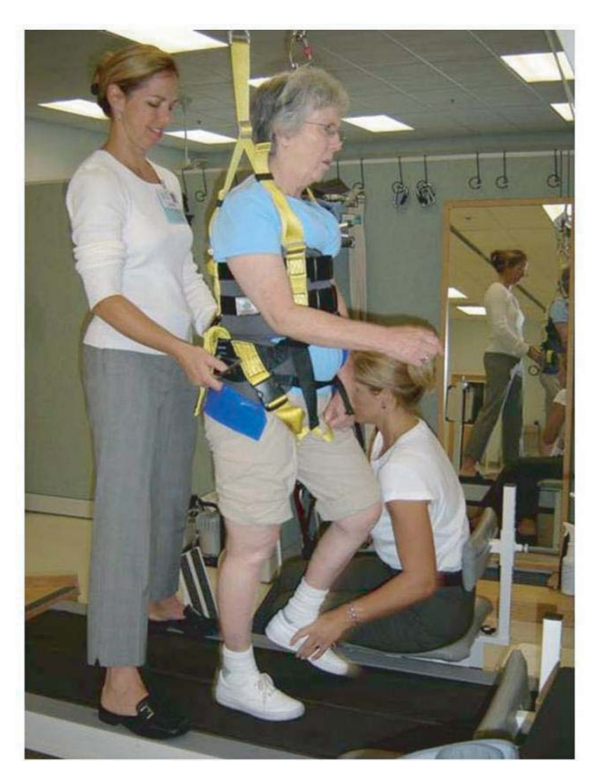
Figure 2 Locomotor Training Program (LTP) – Body weight support with treadmill training. Figure 2 reprinted with permission from Sage Publications [55].

credible training program so that the participants would consider themselves involved in meaningful therapy activity. To match the LTP group, the home exercise group receives 36 therapy visits (3 times per week for 12 weeks) with length of HEP and LTP training sessions the same. Cardiovascular response monitoring during exercise is identical to that done in the LTP groups. In these ways, the HEP intervention will plausibly control for Hawthorne effect but exclusively through interventions that have been shown to have little or no impact on gait speed.